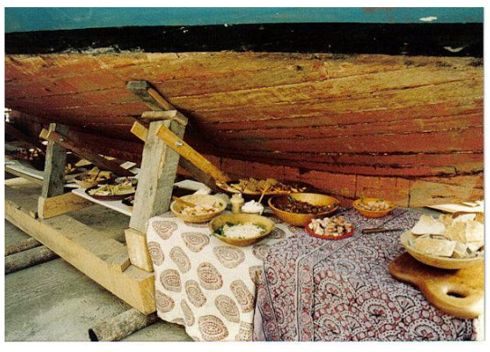
Woody maintenance 1983 The copper paint adds flavor

Circle of Song, Fri, Mar. 25<sup>th</sup>, 7 pm, at the BSC clubhouse