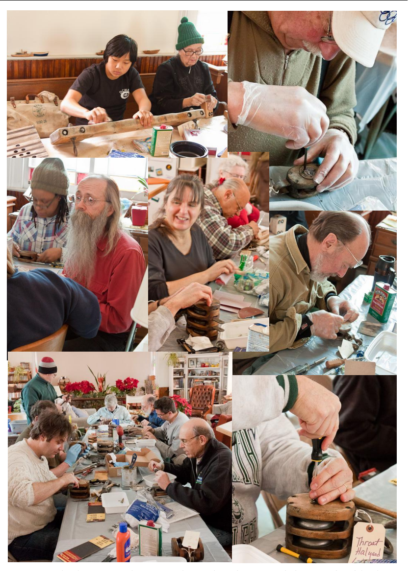
2011 Block Party volunteers cleaned and repaired the wooden blocks used to operate the Woody sails

We'll explore what Beacon was called before it was called Matawan Landing, who were the Melzingah from Melzingah's dam, and the origin of many other place names hidden in plain sight.